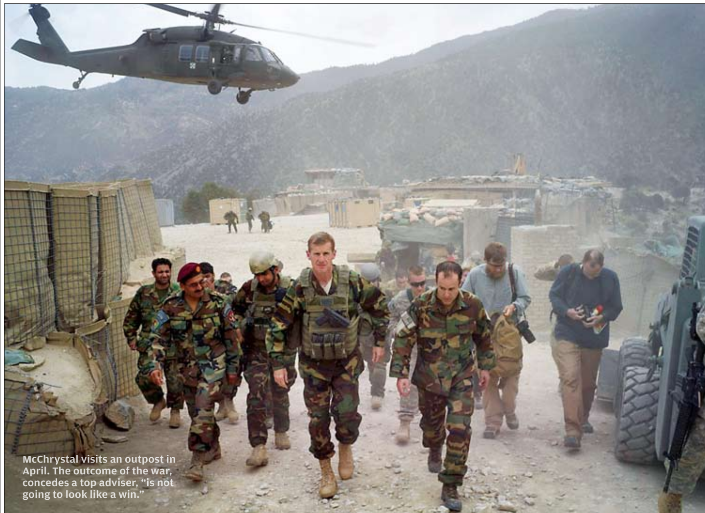
McChrystal visits an outpost in April. The outcome of the war, concedes a top adviser, "is not going to look like a win."

Suck at Fighting" or "In Sandals and Flip-Flops.") McChrystal banned alcohol on base, kicked out Burger King and other symbols of American excess, expanded the morning briefing to include thousands of officers and refashioned the command center into a Situational Awareness Room, a free-flowing information hub modeled after Mayor Mike Bloomberg's offices in New York. He also set a manic pace for his staff, becoming legendary for sleeping four hours a night, running seven miles each morning, and eating one meal a day. (In the month I spend around the general, I witness him eating only once.) It's a kind of superhuman narrative that has built up around him, a staple in almost every media profile, as if the ability to go without sleep and food translates into the possibility of a man single-handedly winning the war.