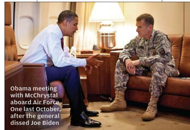
Obama meeting with McChrystal aboard Air Force One last October, after the general dissed Joe Biden